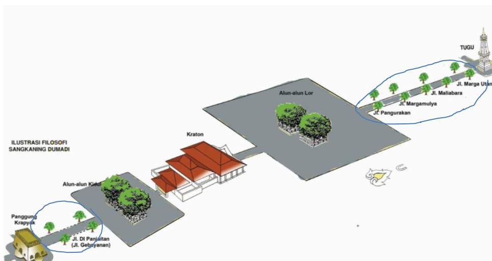
Figure 1: The layout of the roads and the palace (Keraton) and the two city squares (Alun-alun). Those which were renamed are circled.

Research was conducted that investigated all of the dimensions connected to this change of names, the meanings of the names, the history, culture and philosophy behind the names. Importantly, it also consults with a number of important local dignitaries including members of the royal family, about their perceptions and attitudes towards the change of names. Reactions of members of the public were obtained by a search of the Indonesian social media and personal interviews. The research throws light on a complex situation where changes to street names have historical, cultural and philosophical dimensions.